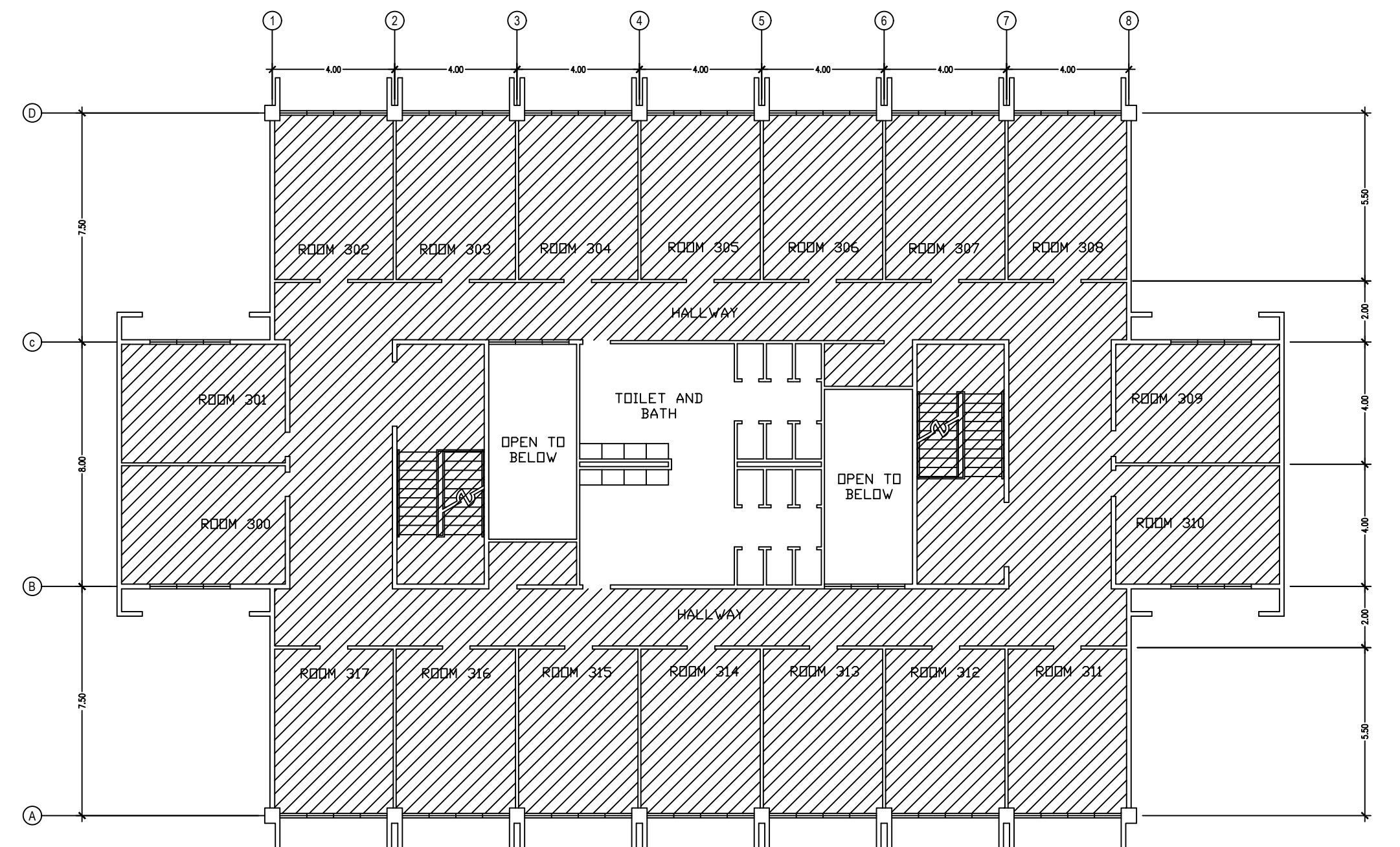
GRHM 3RD FLOOR