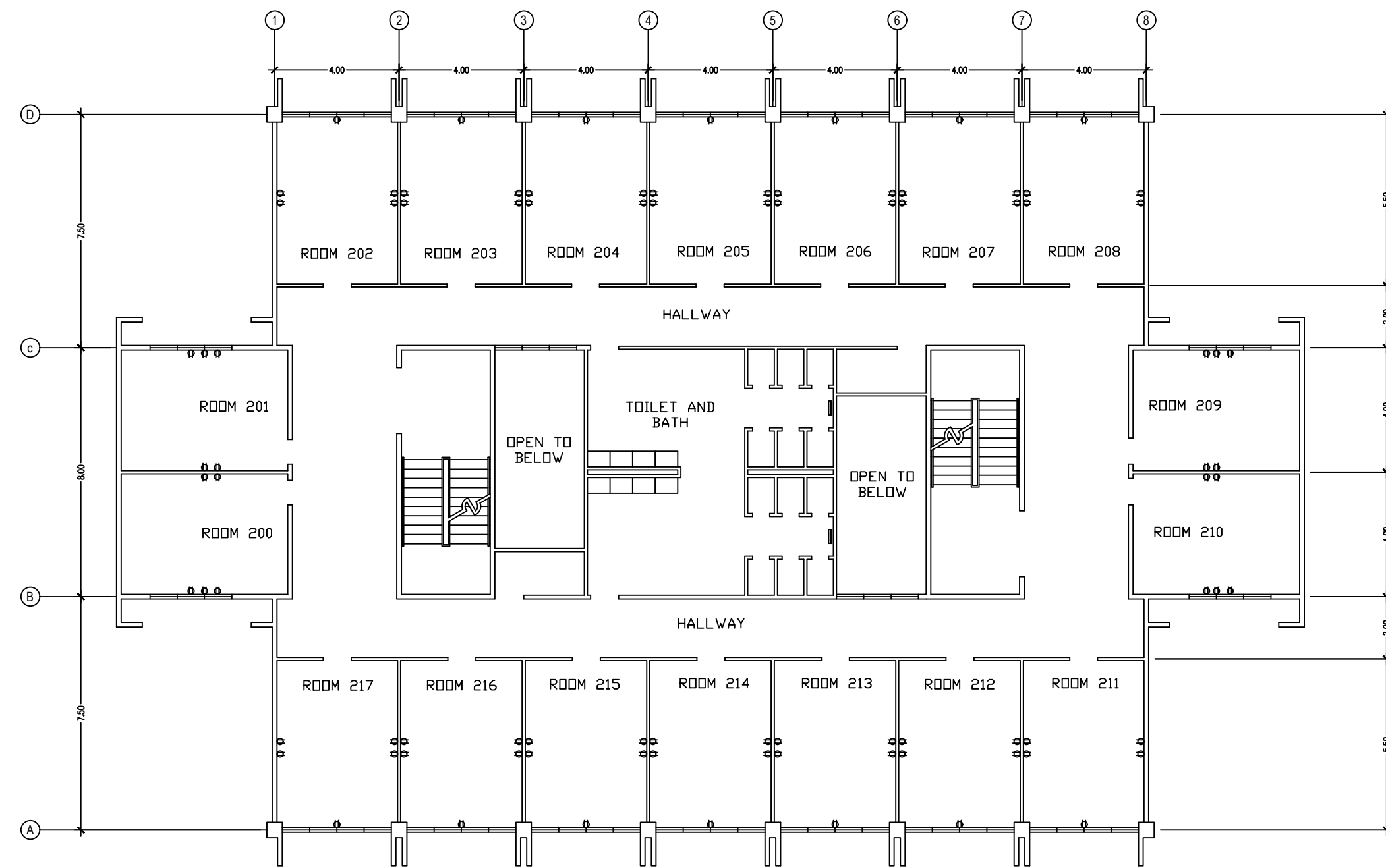
GRHM 2ND FLOOR