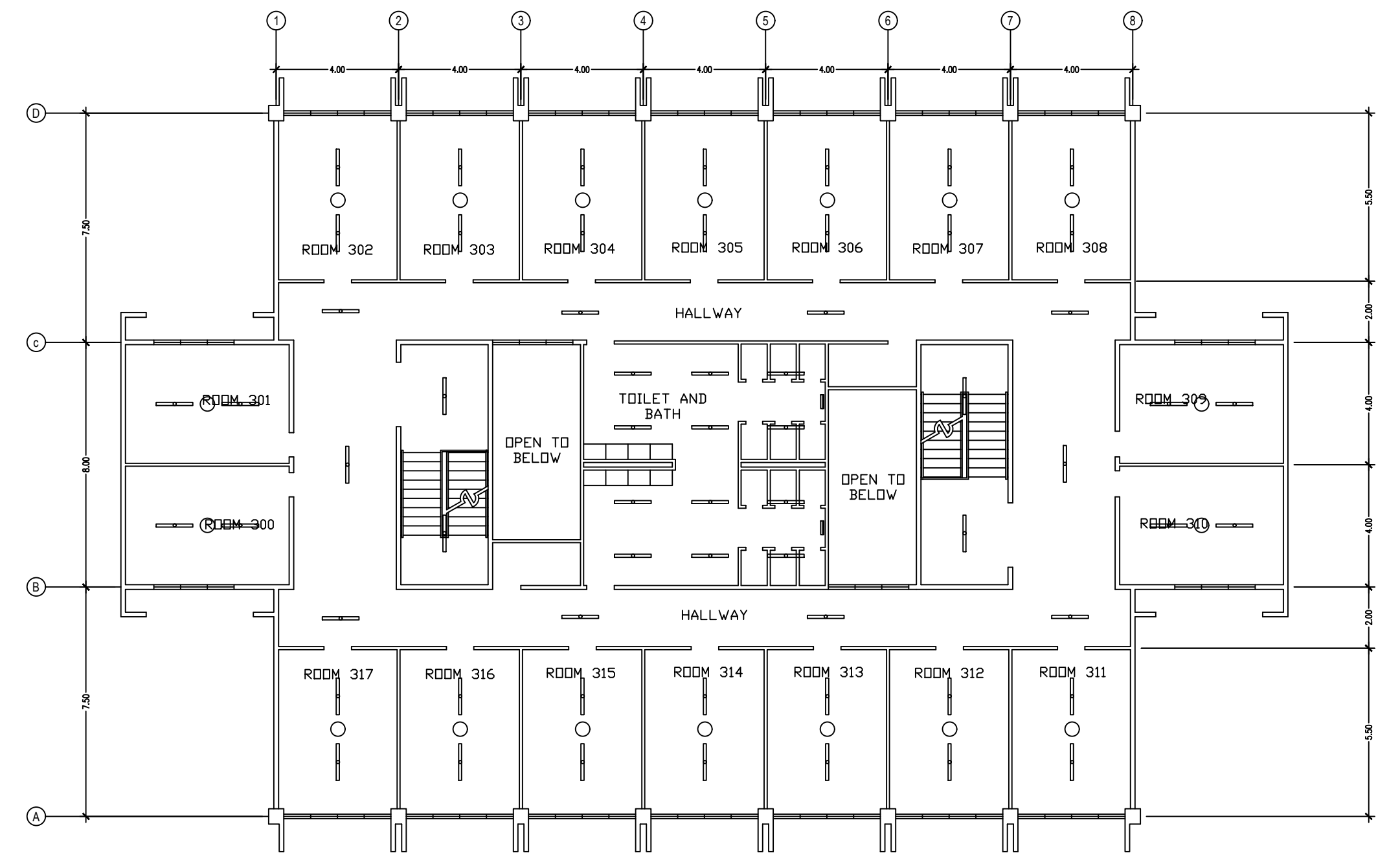
GRHM 3RD FLOOR